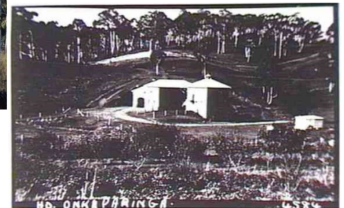
Stone buildings and chimney stack of the old Grunthal Mine.