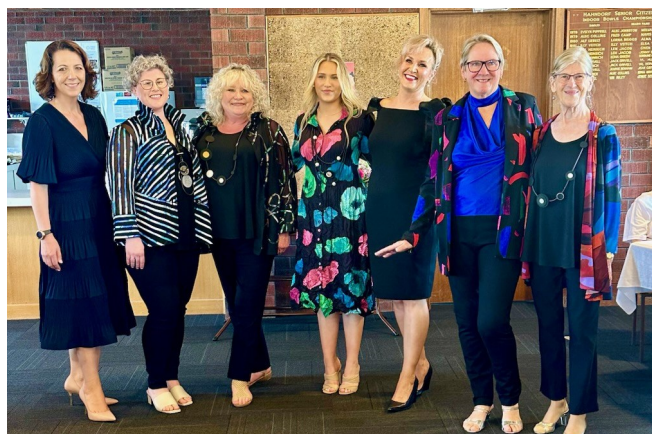
Locals model the beautiful clothing from Blue Belle Boutique