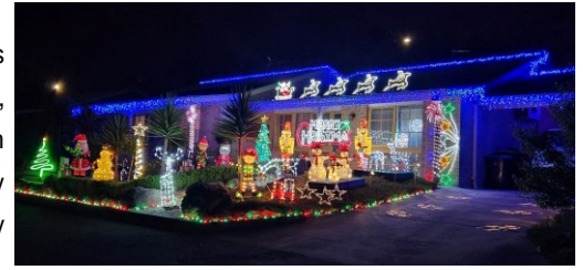
Images: Winner of best display (Day and Night) 2023– St John's Lane

The competitive spirit this Festive Season will hopefully be back on show with local residents embracing the Village's Christmas Lights competition for a fourth year. For the month of December, let us decorate our homes in the Christmas spirit, then take a stroll through our beautiful Village with your family to enjoy seeing others doing the same. Let the community know about your street by posting about it on the HCA Facebook page. Hahndorf Business & Tourism Association have kindly donated prizes for the best displays. No Registration. No Fee. Just Fun.