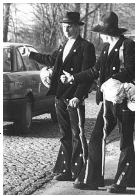
Carpenters "On the Walz" 1990