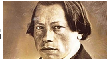
Johannes Menge. Image courtesy State Library of South Australia.

Source: https://adelaideaz.com/articles/minerals-help-motivate-founding-of-colony--johannes-menge ; https://www.mininghistory.asn.au/wp-content/uploads/17-AMHA-Proceedings-Volume-compressed-2.pdf