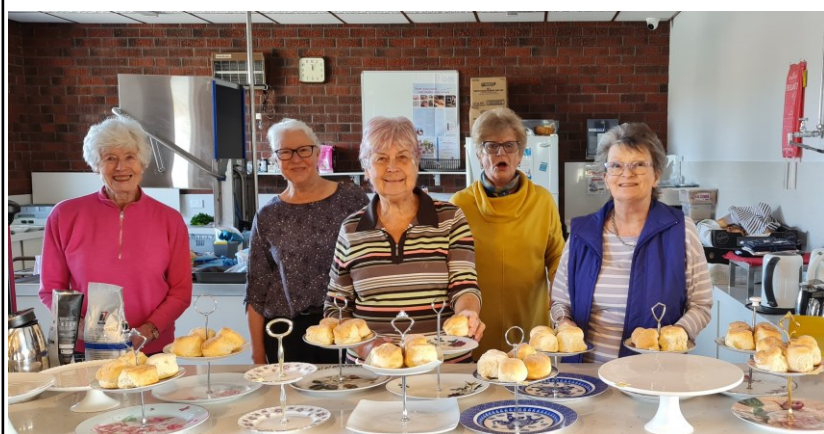
Some of the High Tea organisers and helpers