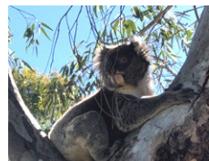
A local resident in and around Braun, Willow End, Valma and Windsor

No.66, winter will be printed and delivered approximately last week of May first week in June 2021.