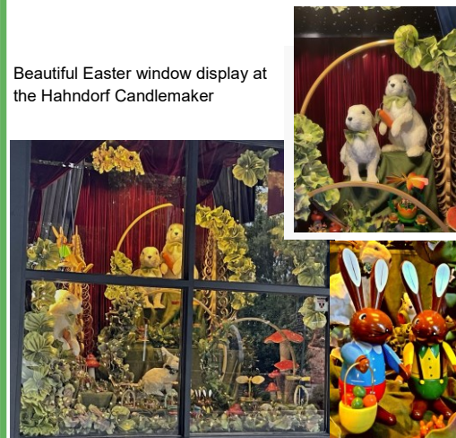
Beautiful Easter window display at the Hahndorf Candlemaker

Sunday 16th May 7:30am- 4pm visit website for more details