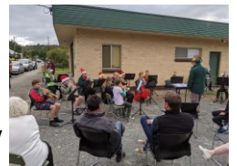
Hahndorf Juniors playing outside the Band Hall to family and friends at their Christmas break-up.