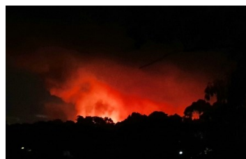
Cherry Gardens Fire from Hahndorf.

Watching on with baited breath as this fire grew creating an enormous volcano like plume of smoke, lighting up the night sky in red and threatening the townships of Mylor, Bradbury, Scott Creek, Jupiter Creek and others, many local residents activated their bushfire plans.