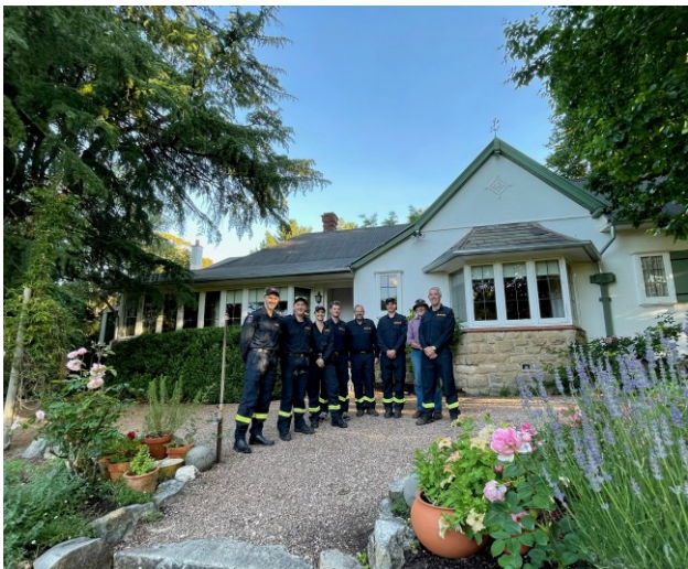
Photo caption: The local Hahndorf CFS team visited The Cedars at the start of bushfire season to advise on bushfire preparedness.