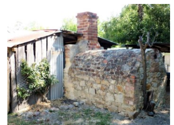
The bake oven at the Schmidt-Rodert Hufe

And once again our other History Festival Event will return on Sunday 2 May. Located at 20 Main Street, the Schmidt-Rodert Hufe is the oldest surviving Prussian farm complex in the Hahndorf township. This humble conservation site will open your eyes and imagination to the life of an early European settler. Explore the buildings and learn about the lives of the people who built, lived and farmed here from 1841. Experience the drama of baking day, taste traditional kuchen and bread baked in the 19th century corbelled oven, fired especially for this event.