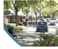
Periodical Elector Representation Review

The Mount Barker District Council's Periodical Elector Representation Review is now open for you to make a submission expressing your views on the future composition and structure of the Council.