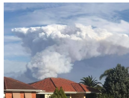
Cherry Gardens smoke plume from Findon.

Most recently on January 24, the Cherry Gardens fire that burnt through more than 2700 hectares, destroying homes and outbuildings, once again saw our township just outside the 'red' emergency warning area, with the CFS advising residents to be mindful of ember attacks.