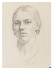
Nora Heysen: Self portrait 1926