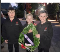
Children from Hahndorf Primary School