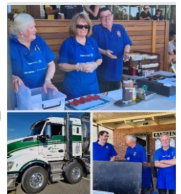
Members of the Hahndorf Lions cooking the sausage sizzle