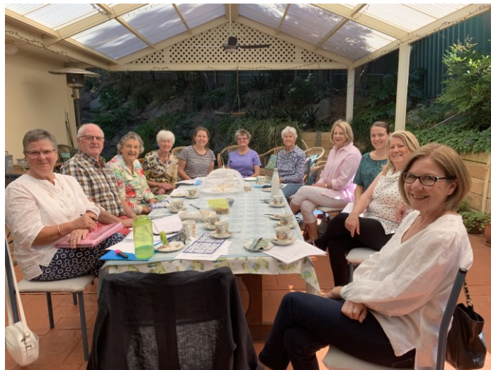
Village Voice Volunteers: April 2022

As we celebrate volunteers, and their endless support to various community groups and causes, we would like to introduce the volunteers who help to bring the Village Voice to life and into your hands each season. Thank you to everyone of you, it could not be done without your help.