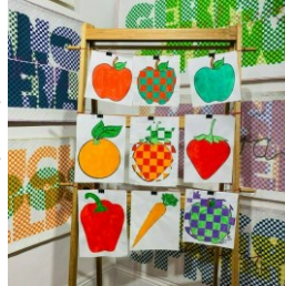
Children's drawing and weaving workshop for SA History Festival.