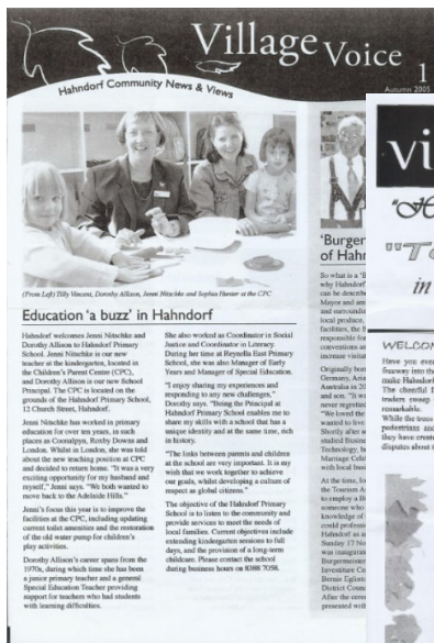
Edition #1 c2005, #18 c2009 printed in black and white and #37 c2014 Hahndorf Village Voice