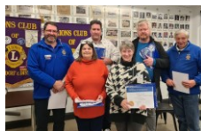
Induction of our new Lions Members

By the way, we are always looking for new members, so if you think you'd like to help your local community, take part in projects of national significance, and enjoy a great deal of fun doing it, pop into the Hahndorf Footy Clubroom on the first Tuesday of the month at 7.30pm and have a chat with our members. We don't bite, and we certainly welcome all people.