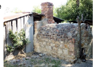
Traditional Bake Oven