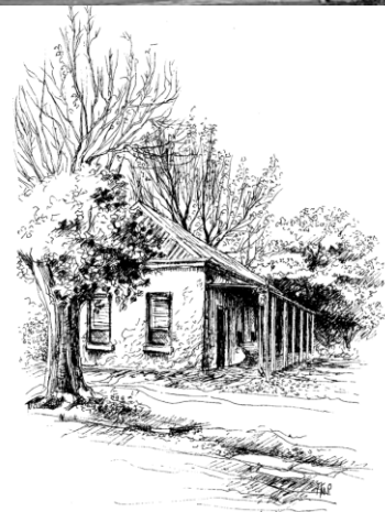
Sketch of 64 Main Street, Hahndorf

Right: image: No.64 Main Street under repair in February 2023.