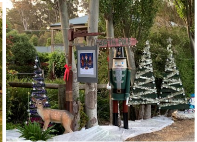
Different Christmas displays from homes around the Village