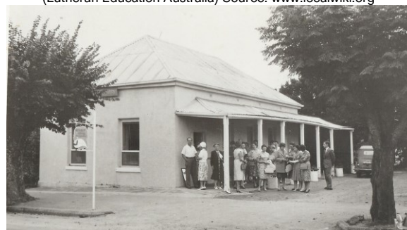
Opening as Art Gallery, December 1954.