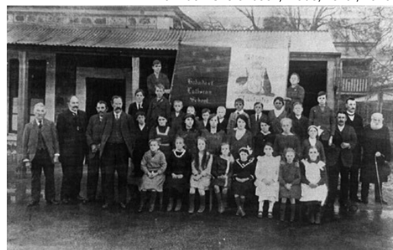
St Michael's Lutheran School- Staff and Students 1917 (Lutheran Education Australia)