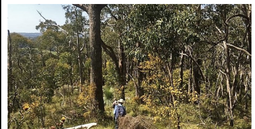
Malcolm Wick Reserve