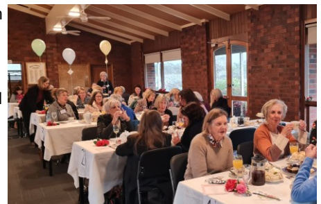
Guests enjoying the day. Images above courtesy of: Monique Lomax