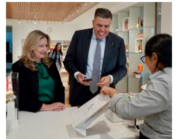
Above: Rebekha Sharkie MP with Milton Dick MP